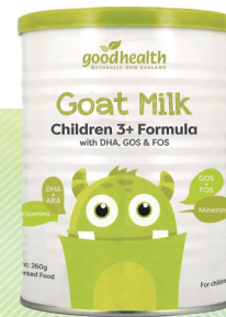
Goat Milk for Children 兒童成長配方羊奶粉 (調製乳粉)