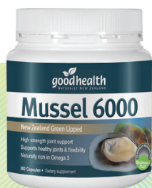
Mussel 6000 綠唇貽貝 6000膠囊