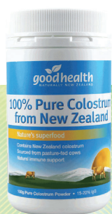
100% Pure Colostrum 100%牛初乳粉