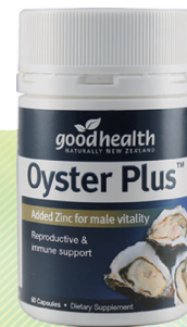
Oyster Plus Capsules 牡蠣精膠囊