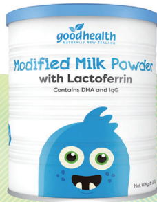
Modified Milk Powder with Lactoferrin 乳鐵蛋白調製乳粉