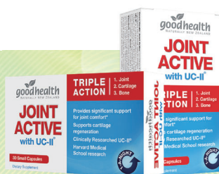
Joint Active with UC-II 骨膠原 三合一膠囊