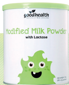
Modified Milk Powder with Lactase 乳糖酶調製乳粉