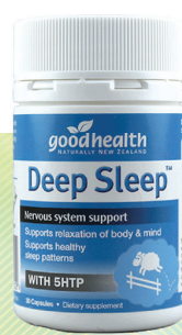
Deep Sleep Capsules 深度睡眠膠囊