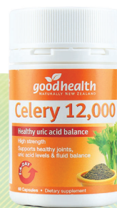
Celery 12,000 Capsules 芹菜籽精華膠囊