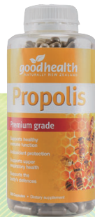
Propolis Capsules 天然蜂膠膠囊