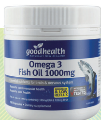
Omega 3 Fish Oil Capsules 深海魚油膠囊