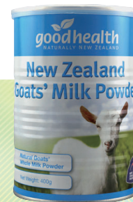
Goats' Milk Powder 山羊奶粉