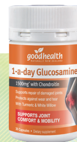
1-a-day Glucosamine 氨基葡萄糖膠囊