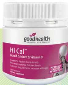
Hi Cal™ Liquid Calcium & Vitamin D 液體鈣維生素D 軟膠囊