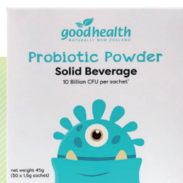
Probiotic Powder Solid Beverage 益生菌固體飲料