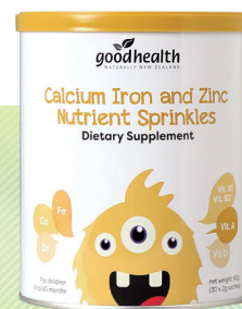
Calcium Iron and Zinc Nutrient Sprinkles 鈣鐵鋅營養包